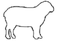
Stew with lamb